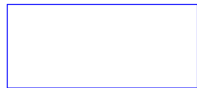
Panel Cut-out 89mm x 43,5mm

PR0327 & PR0328 are supplied complete with a 5 metre cable with the appropriate connector for Mercury controllers